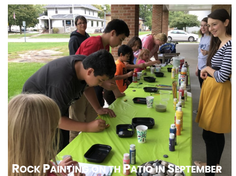
ROCK PAINTING ON THE PATIO IN SEPTEMBER