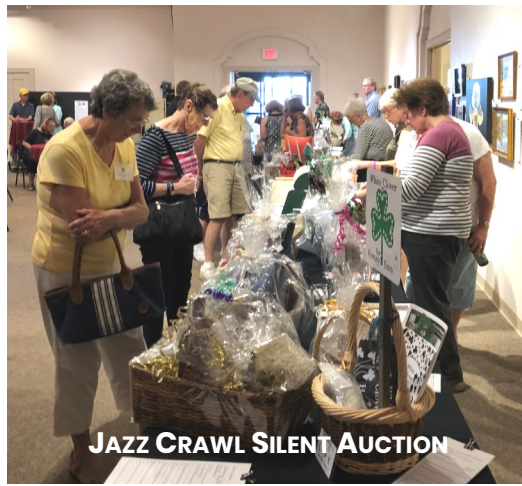
JAZZ CRAWL SILENT AUCTION