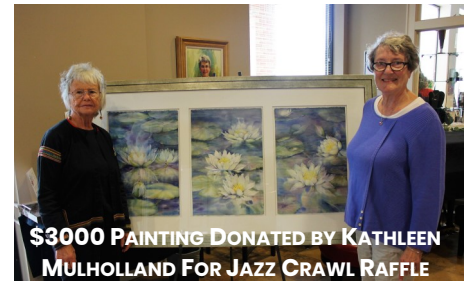
$3000 PAINTING DONATED BY KATHLEEN MULHOLLAND FOR JAZZ CRAWL RAFFLE