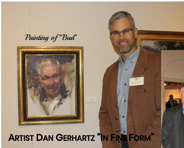
Painting of "Bud"