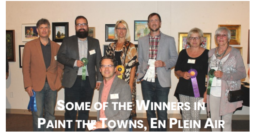
SOME OF THE WINNERS IN PAINT THE TOWNS, EN PLEIN AIR