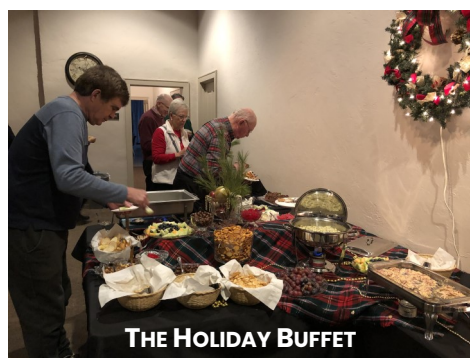
THE HOLIDAY BUFFET