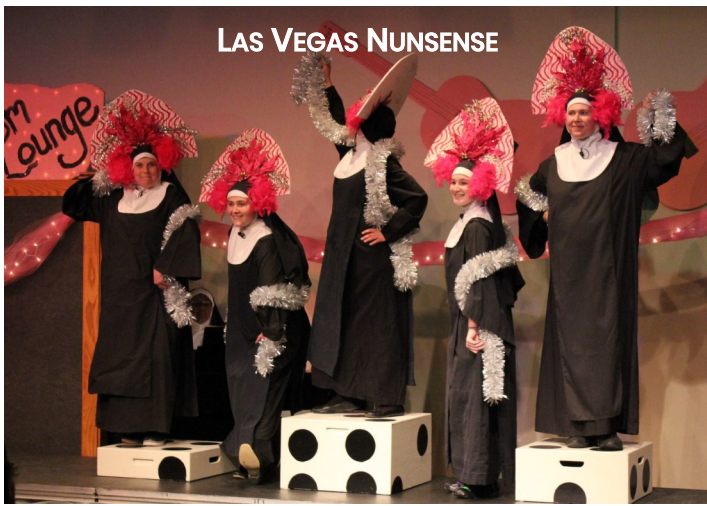
LAS VEGAS NUNSENSE