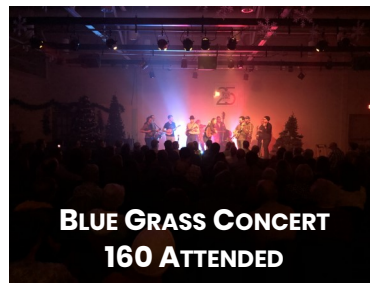
BLUE GRASS CONCERT 160 ATTENDED