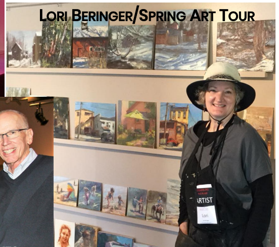
LORI BERINGER/SPRING ART TOUR