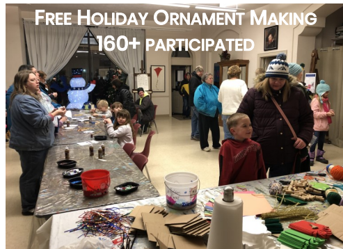
FREE HOLIDAY ORNAMENT MAKING 160+ PARTICIPATED