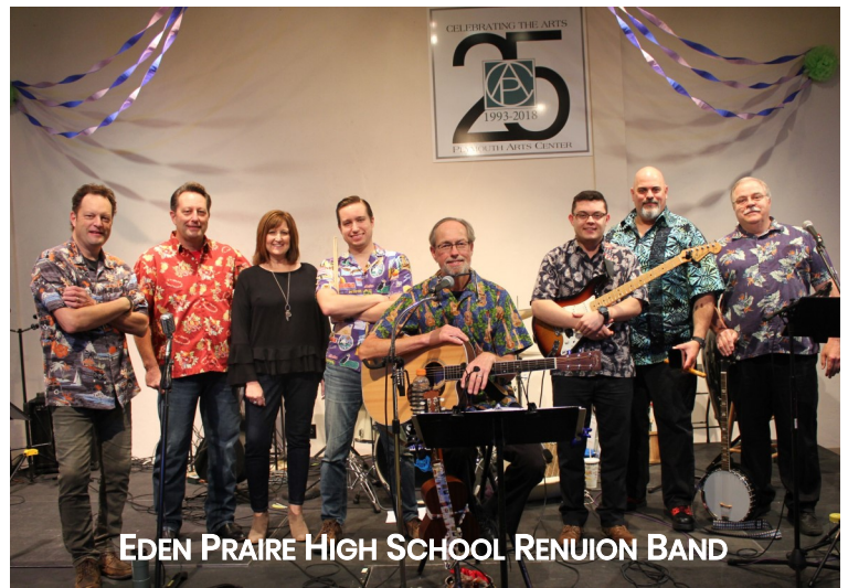
EDEN PRAIRE HIGH SCHOOL RENAISSANCE BAND