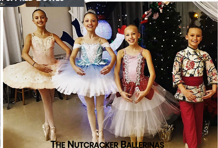
THE NUTCRACKER BALLERINAS