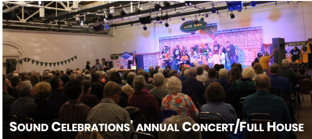
SOUND CELEBRATIONS' ANNUAL CONCERT/FULL HOUSE