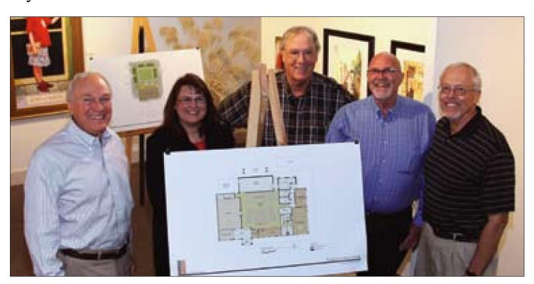
Plymouth Performing Arts Center Building Committee

The Plymouth Arts Center supported the formation of a theater group, which presented its first play in September 1997. In 1999, a Cabaret style musical production was the Arts Center's first major performing arts fundraiser. Events at the Plymouth Arts Center have increased steadily since then. Today with its dynamic schedule of exhibits, theatre, concerts, festivals, art fairs, recitals, and special events, annual attendance exceeds 20,000 art aficionados and the Plymouth Arts Center is the premier art destination in Western Sheboygan County.